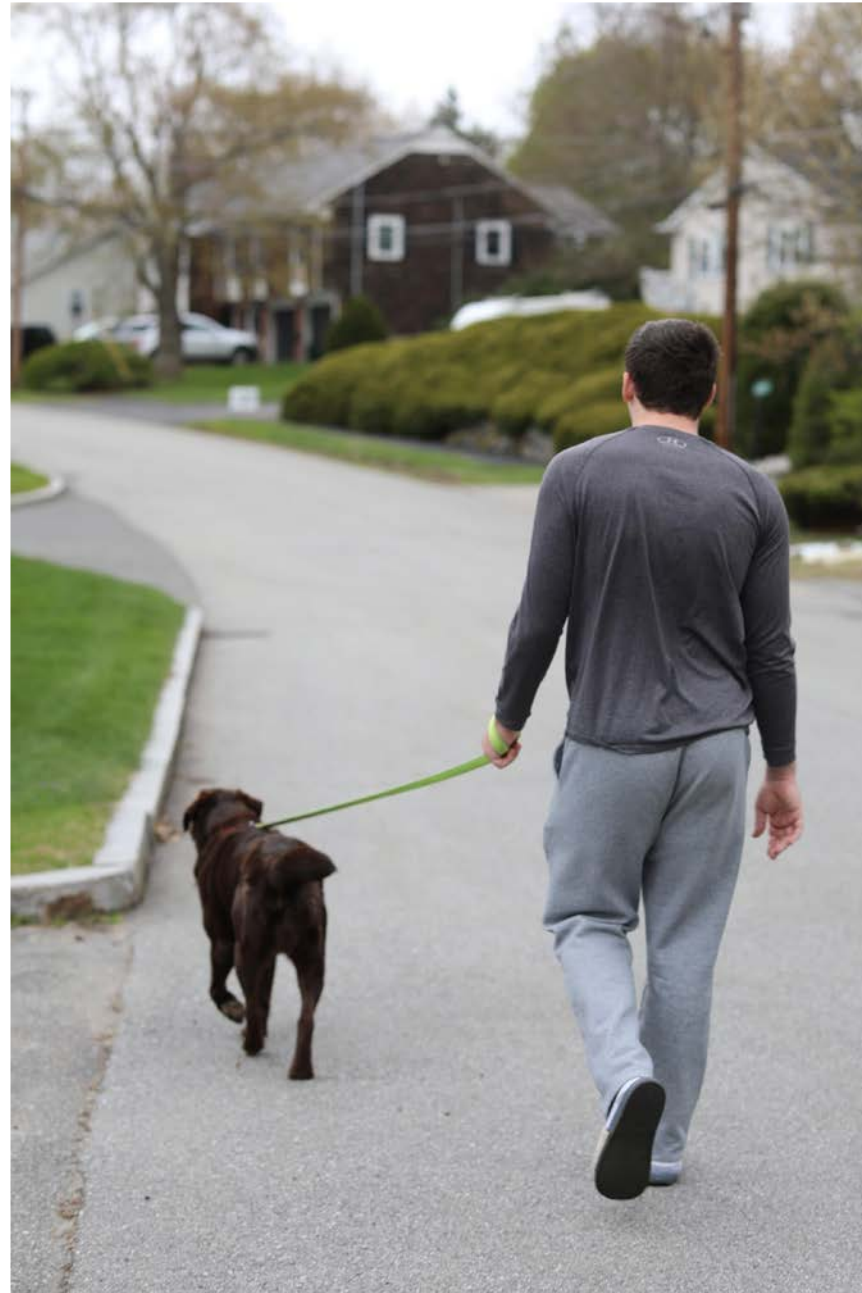
“Take the lead”