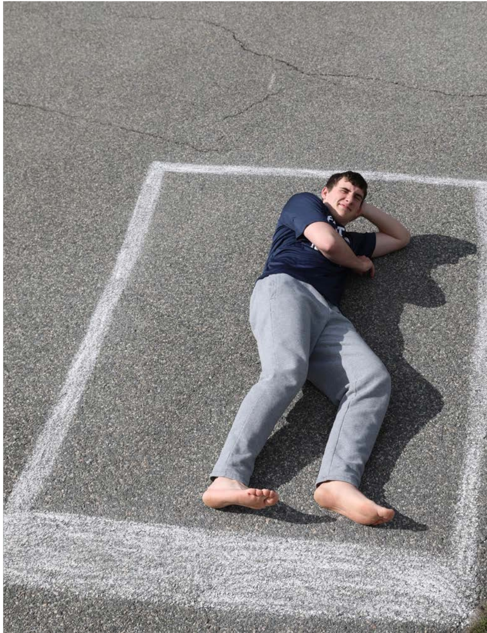
“Strike a pose”