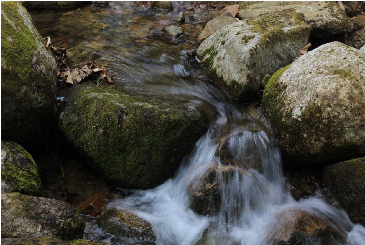
A stream at Belknap mountain