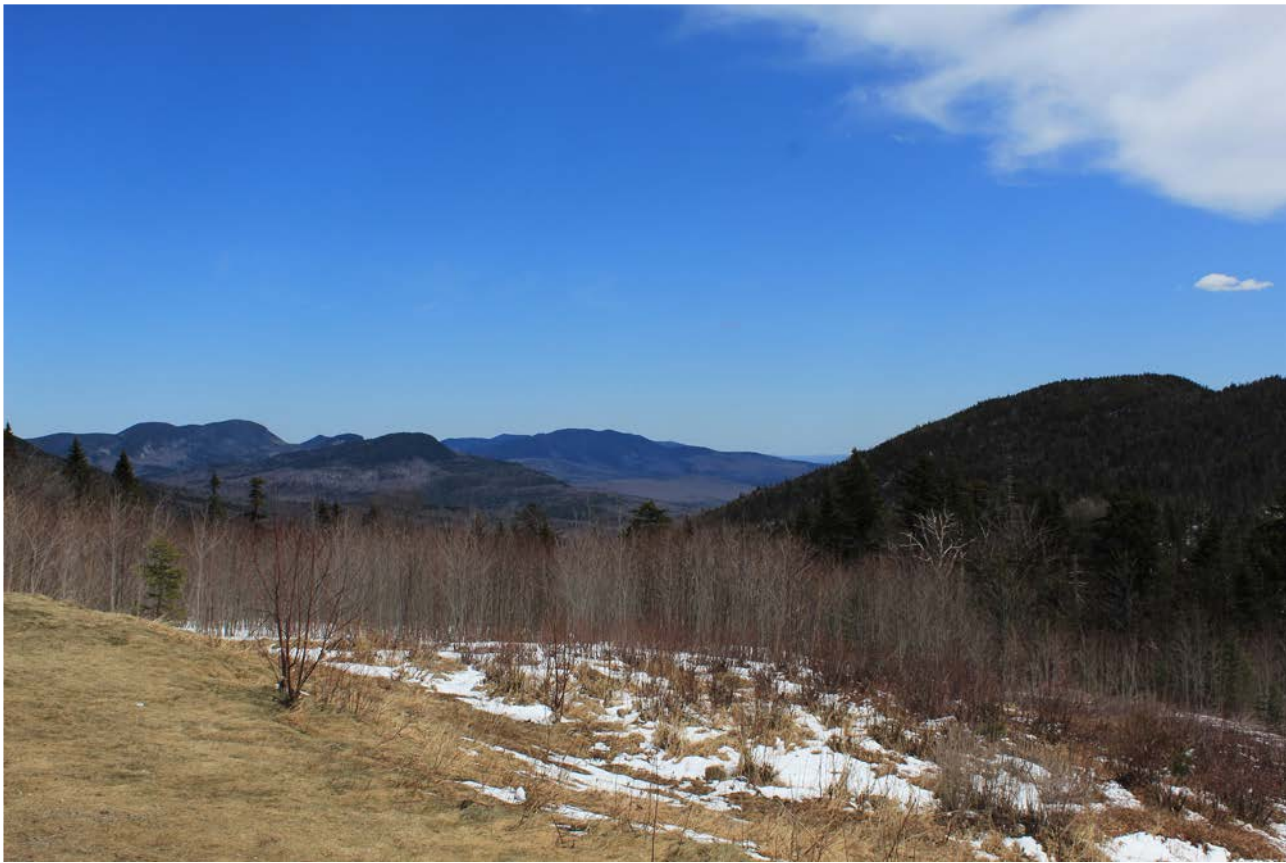
The highest point of the Kangamangus Highway