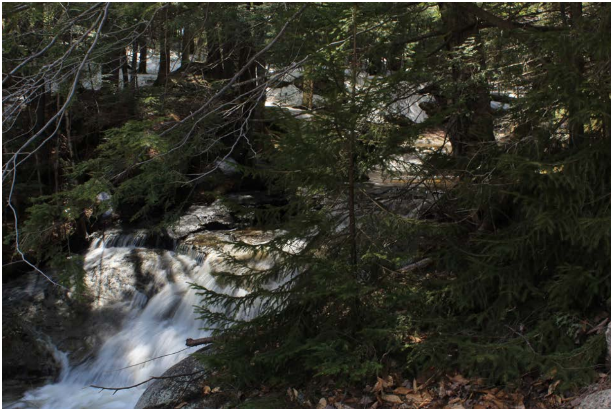
A tree and stream on the side of the highway